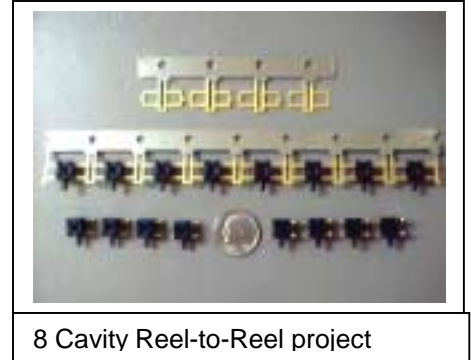
8 Cavity Reel-to-Reel project

The Ironwood Division has just completed its' fifth reel-to-reel project. This project, for the medical industry, includes a progressive stamping die, cut-off and bending dies and an eight cavity mold. We committed to an expedited 12-week delivery and shipped in 11. Ironwood handled this project on a 'turn-key' basis, procuring stampings and plating from outside sources. The complex system includes two inspection cameras and PLC. A system is in development that will package the individual parts in tubes after singulation and bending operations- all in line!