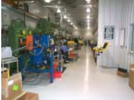
New floors at Ironwood Division

New Equipment: Ironwood: we were in need for a new "face lift" for our production floors. They were getting beat up with every day activity. After shutting shut down for a few days in March, we were back in production in no time. Over Memorial Day weekend, we will be doing our quality, toolroom, and warehouse floors.